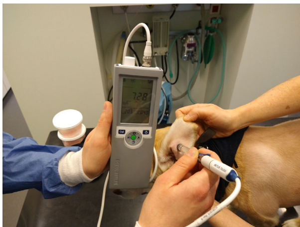
Figure 1. Example of pH measurement at the concave side of the canine pinna.

Dogs were divided into four different age categories; <12 weeks, 12 weeks to two years, >2 to eight years, and >eight years. Based