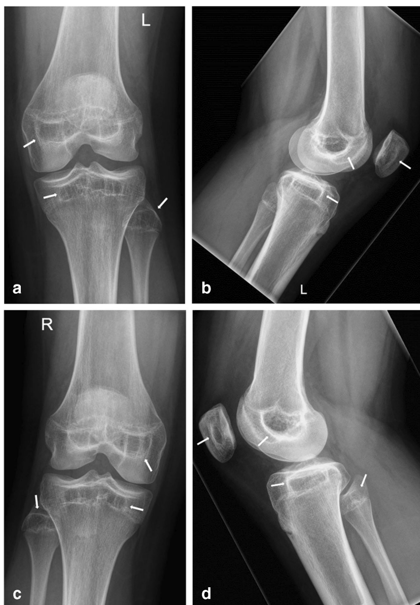
Fig. 1 a–d PA weight-bearing and lateral conventional radiographs of both knees. Arrows indicate epiphyseal/acrophyseal growth arrest lines, outlining the former SOC

The patient had an extensive past medical history. At the age of 3, she suffered from pre-B-ALL, non-high-risk, treated with a standard multi-agent Dutch Child Oncology Group-ALL10 protocol, including vincristine, L-asparaginase, and high doses of dexamethasone with additional intrathecal triple therapy resulting in complete remission at day 40.