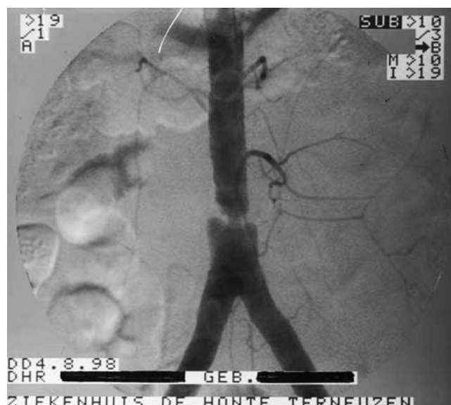
Fig. 1. Angiography illustrating a significant recurrence at the abdominal aorta 8 years after aortoiliac endarterectomy.