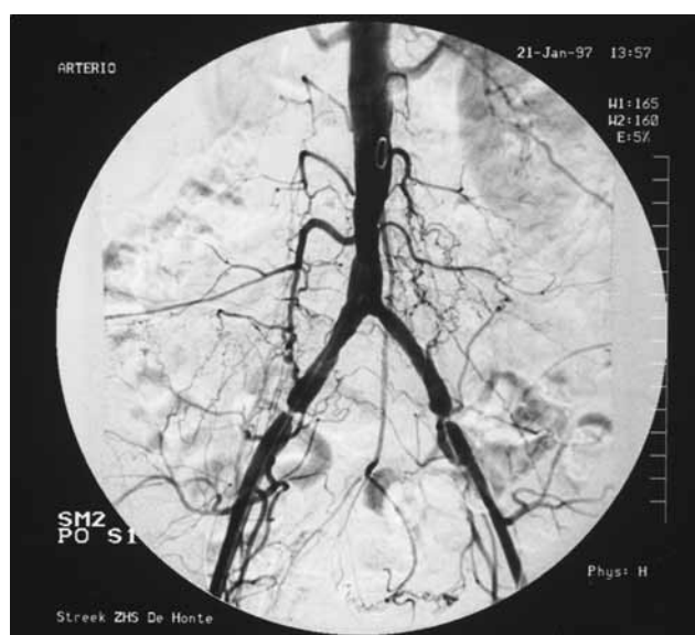
Fig. 2. Angiography revealing typical bilateral recurrent high grade stenosis at the orifice of the external iliac artery 11 years after aortoiliac endarterectomy.

A total of 28 lesions, 25 stenoses and three occlusions in 22 limbs were treated during 18 procedures in 16 patients. Several patients ( n=6 ) had both limbs affected, and some had short stenoses on both the