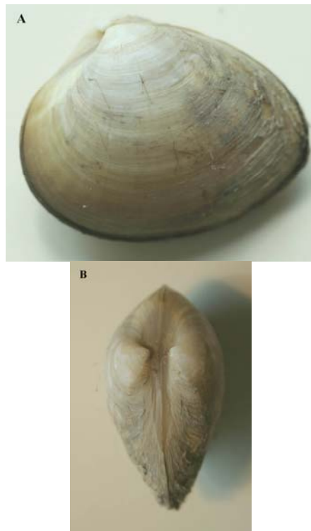
Figure 2. Rangia cuneata , lateral (A) and dorsal (B) outside view. Note the anteriorly curved umbo.